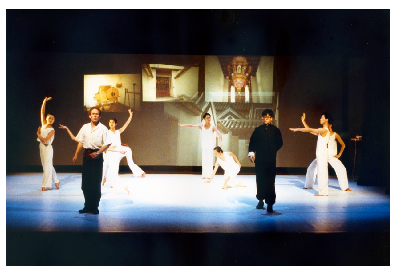
Figure 1: "The Living Tradition" – combined arts performance with images from HK museums

originality take precedence over historical accuracy or factual research; and creativity has a value of its own. In the end the V&A cancelled the project. However my group Inter Artes performed "The Living Tradition" at London's Bloomsbury Theatre on 6<sup>th</sup> May 1989, in a version for soprano, dancers, three instrumentalists and multi-slide projection of images of V&A exhibits. A later version of the work was performed at the Hong Kong City Hall in 1991, with images from local museums (Fig.1). Even when writing a historical novel or directing a performance of historical drama, though the writer/producer will undertake a certain amount of research, authentic historical details alone cannot ensure the success of the work – ultimately it is the drama that matters. My PhD project is similar to "The Living Tradition" – its purpose is to create a performative work inspired by Cantonese opera at a time when the art form is in danger of becoming a lifeless museum exhibit. The frustration of working on a creative/performative PhD was like a déjà vu of the V&A experience – complying to procedures instead of following the surge of inspiration, and having to explain this and that all over again.